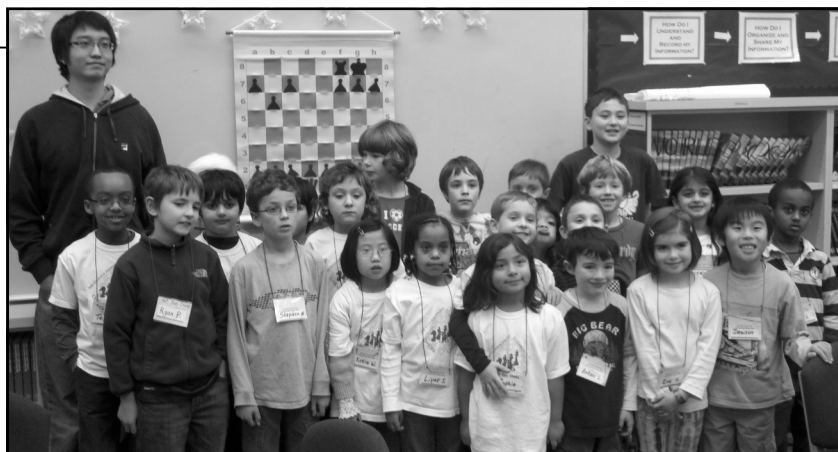
Meridian Park's Recreational Chess Club

Both Tournament and Recreational Chess club kids participated in the Meridian Park Chess tournament on Saturday, January 15, with 200+ players attending.